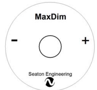
MaxDim Panel Placard